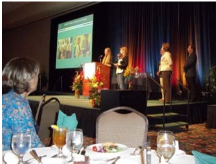
Pueblo Animal Services accepting the Team of the Year award. See page 7.

The leadership represented CACVT during the first combined CVMA-CACVT Membership Luncheon and Award Ceremony. The team-oriented event gave the opportunity for the Colorado veterinary community to come together and celebrate the achievements of teams and individuals who make our community exemplary in the nation.